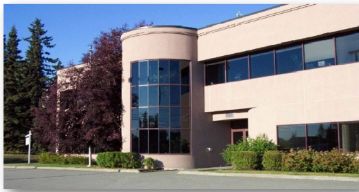
Pedro Bay Corporation Headquarters

1st Annual Elizabeth Peratrovich Legal Clinic During AFN, lawyers will be available to assist attendees free of charge on October 20th 1-4pm (general civil legal issues) and October 21st 8-11am (will and estate planning). A limited number of 1 hr appointments are available each day. Email your contact information preferred meeting time and a brief description of your request to eplc@alaskabar.com to reserve your space.